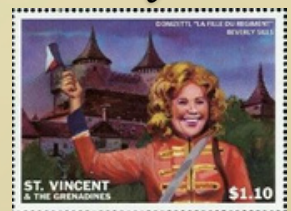
Soprano (1929 - 2007)