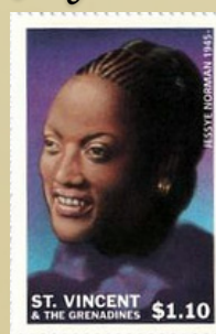
Soprano (1945 - 2019)