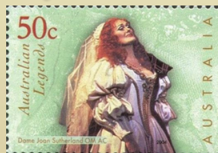
Soprano (1926 - 2010)