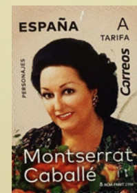
Soprano (1933 - 2018)