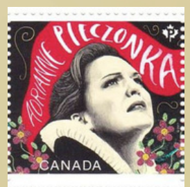
Soprano (b. 1963)