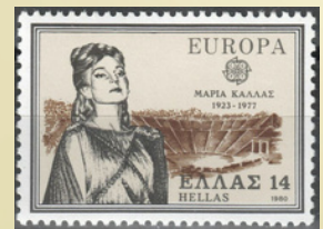
Soprano (1923 - 1977)