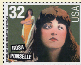
Soprano (1897 - 1981)