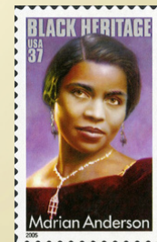
Contralto (1897 - 1993)