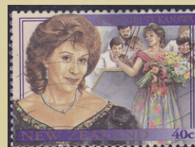
Soprano (b. 1944)