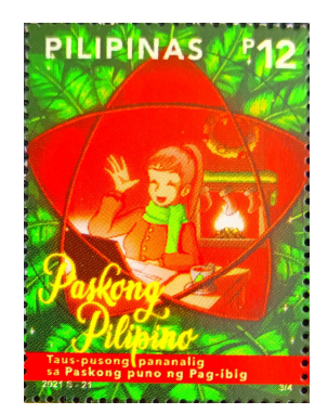
Beautiful stamp issued by Philpost at Philippines On the occasion of Christmas in 2021 showcasing how Peoples connect using virtual connecting software.

Many World countries issued a commemorative stamp showcasing the use of technology to bridge distances, showcase virtual events, and highlight the impact of virtual connectivity on various aspects of life, such as education, work, and social interactions. During the pandemic times, world countries commemorated many stamps showcasing how people connected with each other by virtual means