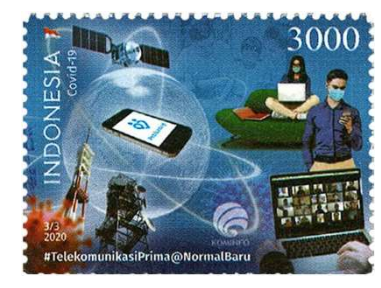
POS Indonesia issued 3 stamps in 2020 on pandemic theme, where this stamp sympathize virtual connecting during lockdowns.