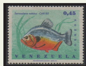
Blackspot Piranha (Serrasalmus notatus)