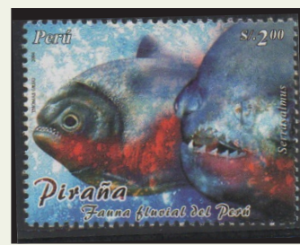
Piranha (Serrasalmus sp.)

LOVE IS IN THE WATER, Piranhas takes mating very seriously, they go ferocious against anything that disturb their moment, and also when they are guarding they egg on wet season.