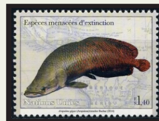
Arapaima (Arapaima Gigas)