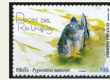
Red-bellied Piranha (Pygocentrus nattereri)

After blocking off part of the river and starving the piranhas for several days, they pushed a cow into the