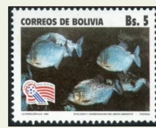
Black-tailed Piranha (Serrasalmus piraya)