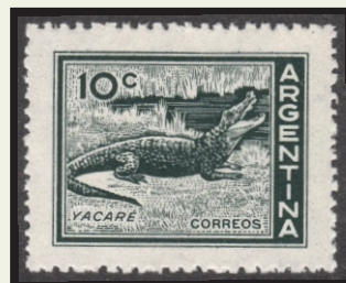
Yacaré (Caiman yacare)

There are many species of piranhas, they grow to 5–14 inches long, All of them have a single row of sharp teeth in both jaws. The most common is the red-bellied ones and they are known for their voracious appetite, especially for fresh meat that enters their domain. But also they become food for Yacare Caiman or scaled armor big fish as Arapaima.