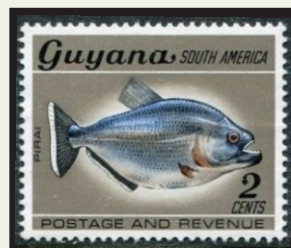
Gold Piranha (Pristobrycon aureus)