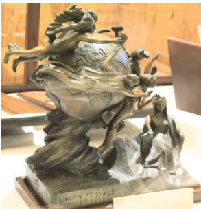
↑ Universal Postal Union Sculpture in the museum

The museum also has a hall showing postage stamps from different parts of the world gifted to Egypt during the UPU's 10th Conference in 1934.