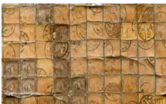
↑ A section in close view showing the stamps with seals used in the mosaic.

A Stamp of Pyramid and Sphinx priced at 1 Piastre issued in 1879. W 2.5 cm x H 2 cm →