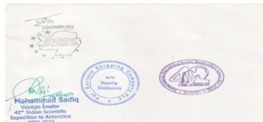
A cover with the the Ultimate HELI Pvt.Ltd Helicopter seal ,signature of voyage leader Mohammed Sadiq ,Ice class vessel MV Vasily Golovnin and the 42 nd expedition official seal

Conclusion: All the expeditions are under Ministry of Earth Sciences of Government of India.The post office at "Maitri" station acts as vital means of communication for all scientists and officials posted at the station.