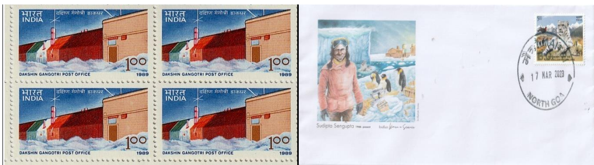
Stamp released by India in 1989 on Dakshin Gangotri Post office (1984).