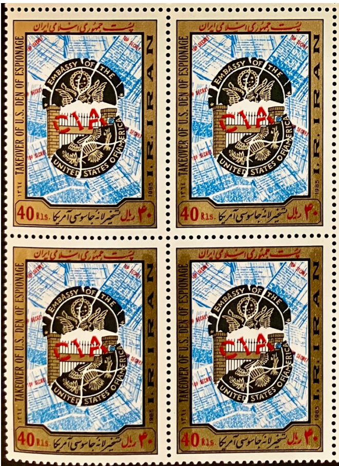
Above: Germany (2020) Top-Left: China (1945), overprint of air raid precautions issued by Japanese occupation Center-Left: United States (1973) Lower-Left: Iran (1985)

In characteristic fashion, the CIA’s solution to losing face was to develop plans to poison or kidnap Assange. Some of the proposals involved breaking into the Ecuadorean embassy in London and dragging him out, and shooting out the tires of a plane if Assange was onboard.