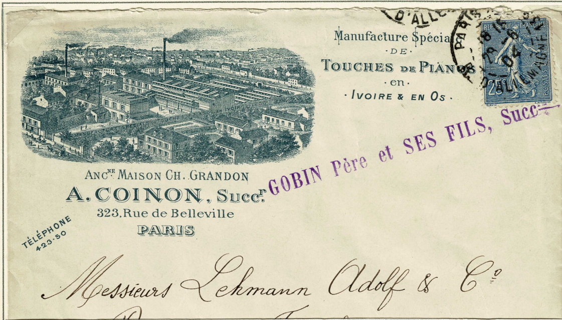
Commercial cover, Paris 06/28/1904 to Berlin. « Manufacture spéciale de touches de pianos en ivoire & en Os » (Special manufacture of piano keys in ivory & bone).

European legislation of the use of ivory in musical instruments such as keyboard instruments (piano, harpsichord, organs, etc.) has been exempted by lobbying. The instruments with ivory keys built before 1947 are sufficient if a certificate proving their age is presented. The use of ivory in new instruments after 1947 is not allowed.