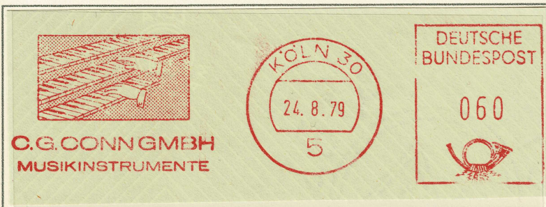
Köln, 08/24/1979. Three manuals organ with ivory keys.