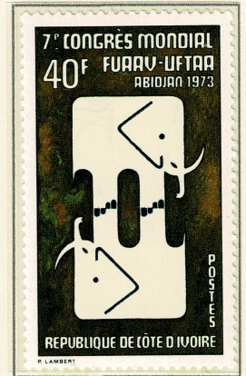
Republic of Ivory Coast: ivory sculpture to make piano keys from elephant teeth.