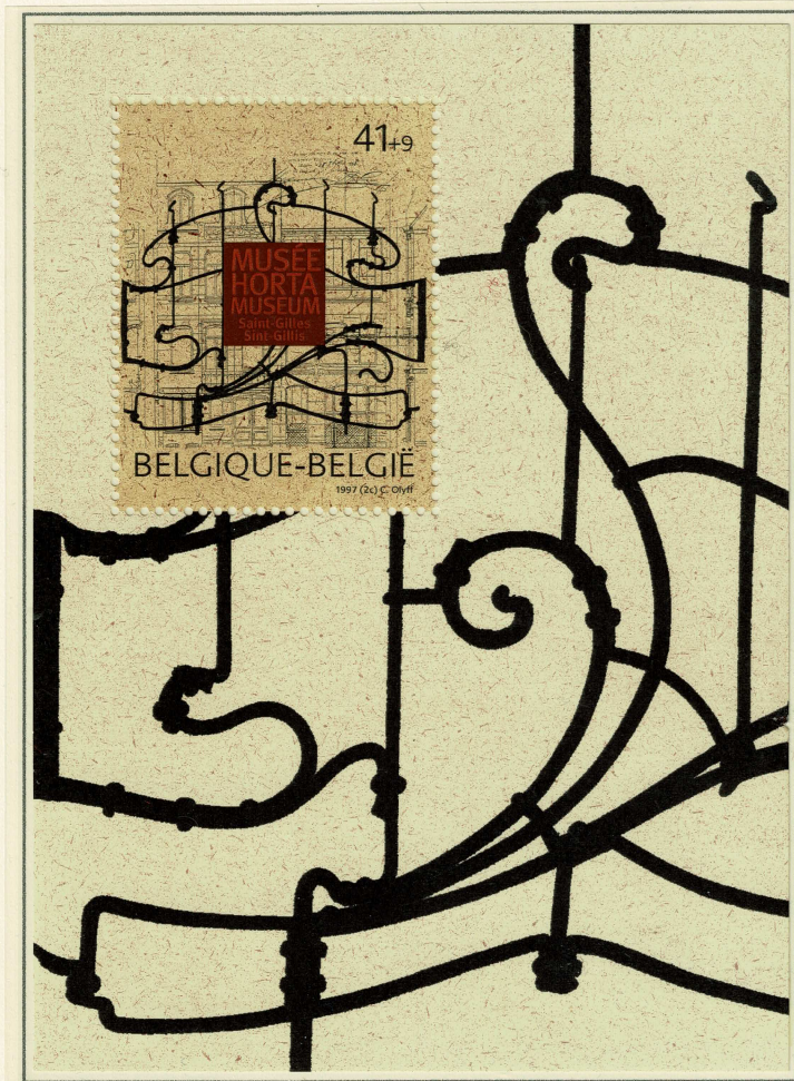
1997, Horta Museum: stamp in limited edition.

The Art Nouveau movement of architecture and design first appeared in Brussels, Belgium in the early 1890s and quickly spread to France and to the rest of Europe.