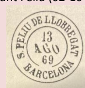
Fragment of letter with S. Feliu postmark (13-8-69)