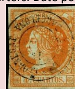
4 quarters with postmark of Sant Feliu Ll (1861)