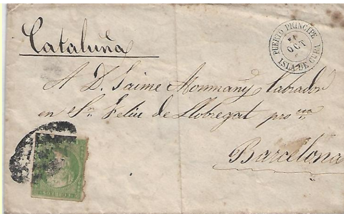
From Puerto Principe to Sant Feliu de Ll. Stamped with a 1 real. Puerto Principe postmark (circa 1863). Crosses grill postmark.