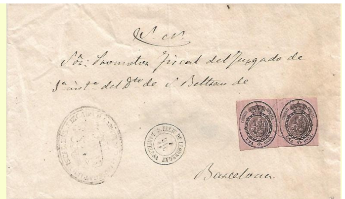
Letter from the Court of Sant Feliu de Llobregat to Barcelona. Postage with 2 pink 1 ounce stamps. Court Seal. Date postmark, type II dated 12-6-1862.