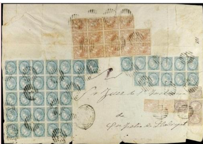
Judicial escrow franked with 16 stamps of 50 ms. brown, 39 of 10 cents green and 4 of 20 cents lilac. Court Seal. Grill postmark. Year 1867. (Graus certificate)