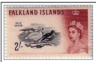
1960. Kelp Geese

American coots have white bill, with a red swelling along the upper edge. Their lobed toes make coots powerful swimmers, especially in open water with weird feet. Comparable to webbing on a duck's foot, the palmdate toes help a coot push through the water . On land, the lobes fold back when the bird lifts its foot, which facilitates walking on a variety of surfaces like mud, grass, and even ice They have a wingspan of 58 to 71 cm. Their feathers are dark grey, with a white patch under the tail.