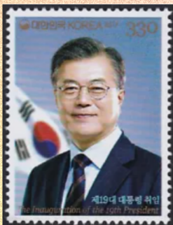
2017 Korea Post stamp of Moon Jae-in

BTS spoke again at that year’s 76th UN General Assembly and even performed their hit song, “Permission to Dance,” in the assembly hall and outside headquarters. (scan the QR code to watch). On June 13, 2023 Korea Post released BTS Our Moments Through Songs , a special stamp sheet commemorating the band’s 10th anniversary. All seven members of BTS are currently completing their mandatory military service in South Korea and plan to reunite in 2025.