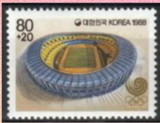
1988 Summer Olympics stamp featuring Seoul Olympic Stadium

The South Korean K-pop boy band, BTS , made their debut in 2013 with the release of their first studio album, Dark & Wild . Over the next ten years, BTS and its seven members— RM, Suga, V, J-Hope, Jin, Jungkook, and Jimin —would go on to achieve global fame and success. Their music promotes self-love and freedom of expression and reflects the group’s desire to break down stereotypes of masculinity. The positive messages in their music created a devoted fanbase, known as ARMY. BTS has performed sold-out concerts all over the world and at South Korea’s Seoul Olympic Stadium in 2018, 2019, and 2022.