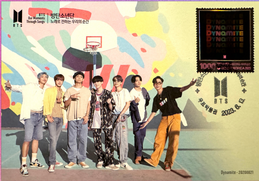
Official BTS Our Moments Through Songs maximum card, postmarked June 13, 2023 with postage stamp featuring the “NightTime” EP cover for BTS’ 2020 hit song “Dynamite”

by Claire Sewell, clairebrarian@gmail.com