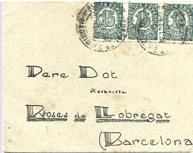
Letter from Madrid to Roses de Llobregat (24-10-1938)