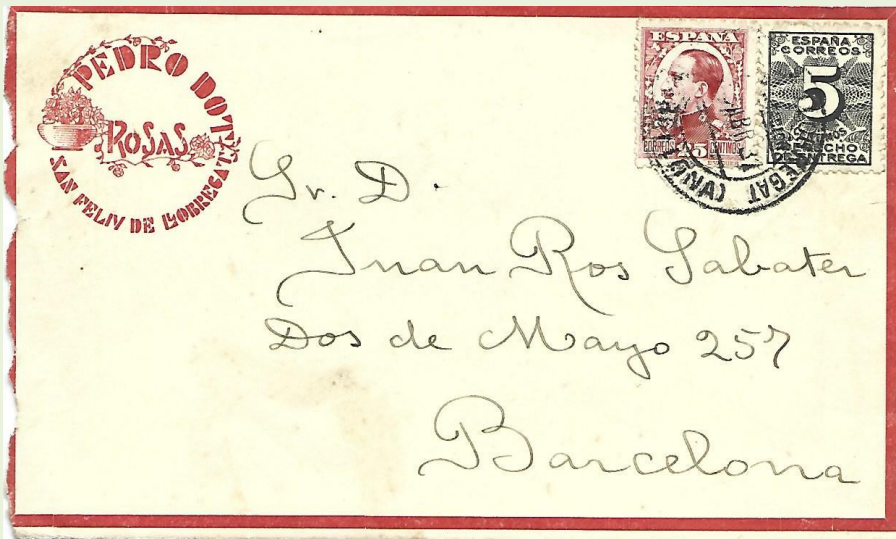
Letter from Sant Feliu de Llobregat to Barcelona. Postmark of Sant Feliu de Llobregat dated -APR 1931. Frankened with 30 cents of peseta.