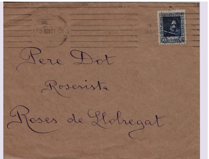
Letter from Barcelona to Roses de Llobregat (15-11-1938)