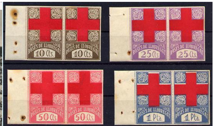
Local stamps issued on cards by the "Local Committee of Roses de Llobregat" (couples). 1936-1939.