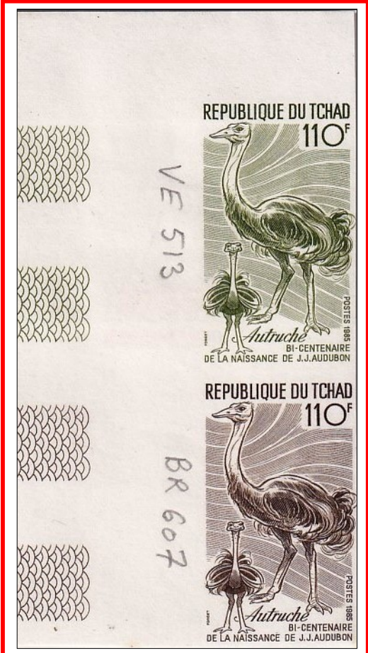
1985. Chad, Audubon, Ostrich, Imperf Composite progressive color trial With plate number and marginal jewels. Engraver FORGET