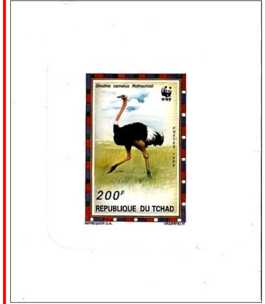
1996. WWF, Chad Ostrich Sunken Deluxe Sheet, Engraver Rothschild