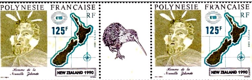
1990. French Polynesia - Maori World. Gutter pair showing Southern Brown Kiwi