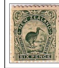
1898. p. 12 no wmk