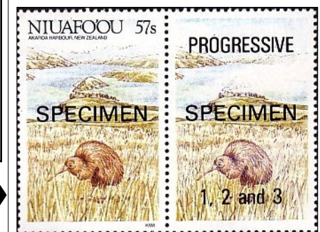
1988 Niuafou Specimen Pair Progressive color Trials