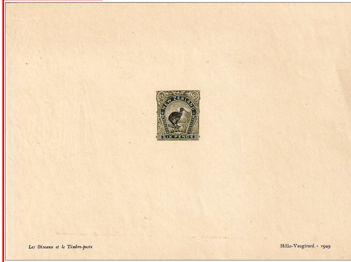
Les Oiseaux et le Timbre-poste