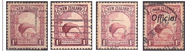
1935-36 . New Zealand- Definitive - Color Varieties and ovpt