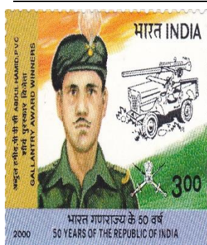
ABDUL HAMID IDRISI Issued in 2000