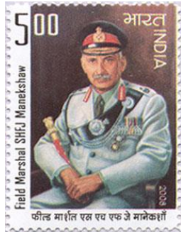
Field Marshal SHFJ Manekshaw Issued in 2008