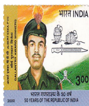
ALBERT EKKA Issued in 2000