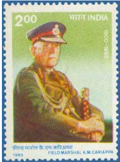
FIELD MARSHALL K.M.CARIAPPA Issued in 1995