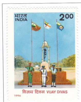
Issued in 1996 in Commemoration of Vijay Divas. The stamp depicts members of the three services at the War Memorial.