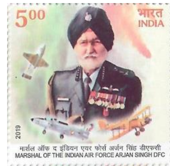
Marshal of the Indian Air Force Arjan Singh DFC Issued in 2019