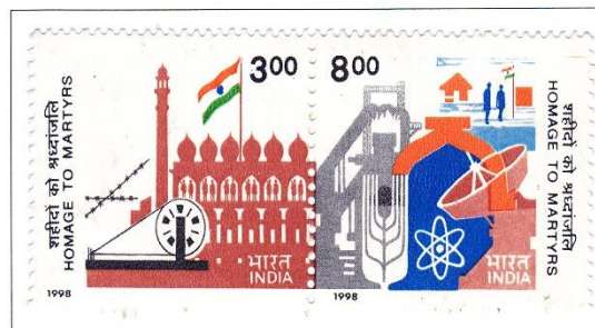
HOMAGE TO MARTYRS (SE-TENANT) Issued in 1998