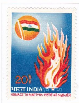
HOMAGE TO MARTYRS Issued in 1973