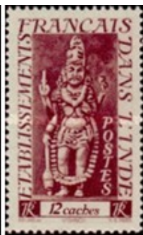
Kali Temple near Pondicherry