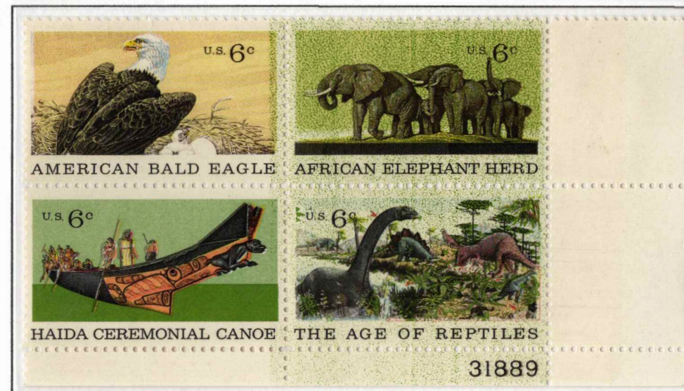
Odd inking problem.

FREAKS and ODDITIES are mistakes that happen during production of postage stamps, such as color shifts, inking problems and mis-perforations.