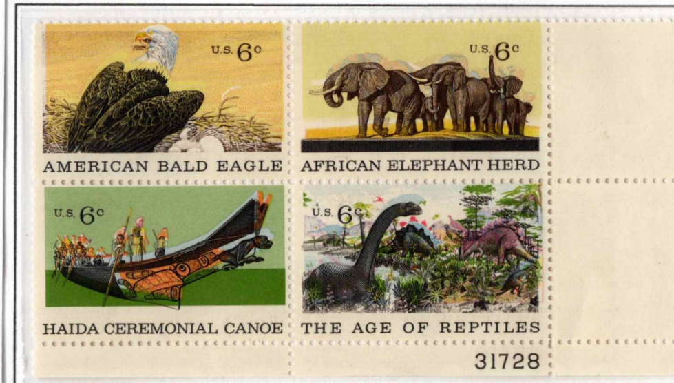
Color shift up 1.2 mm.