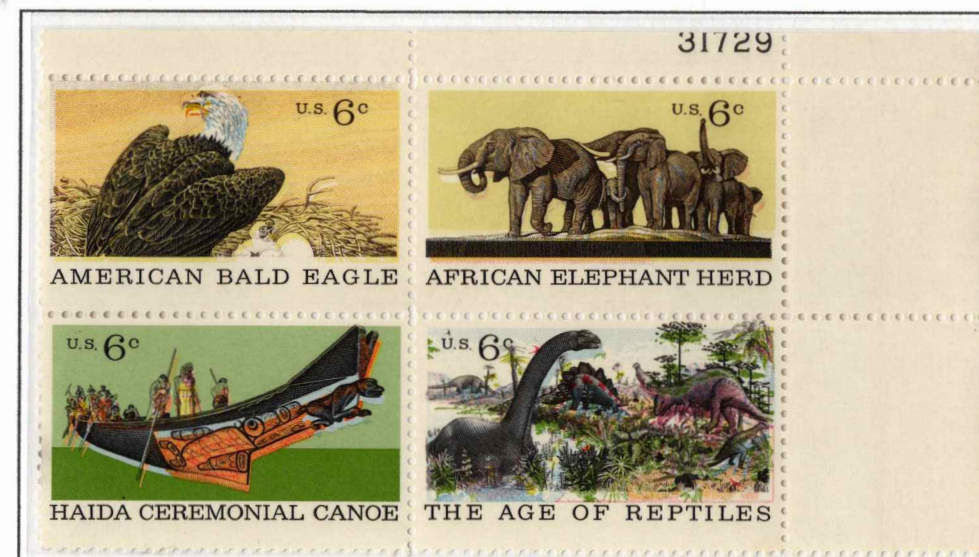
Color shift down 1mm.