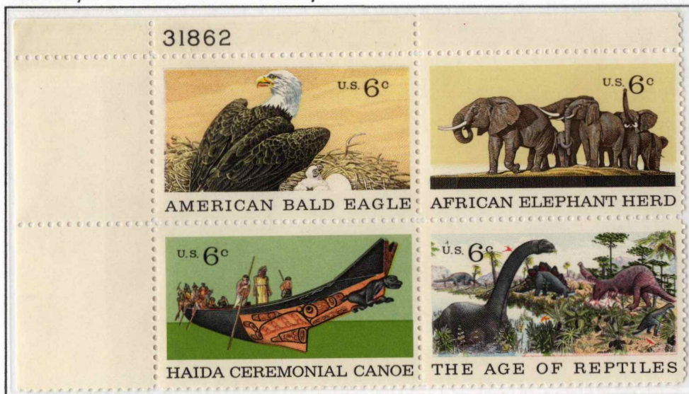
Block of four.