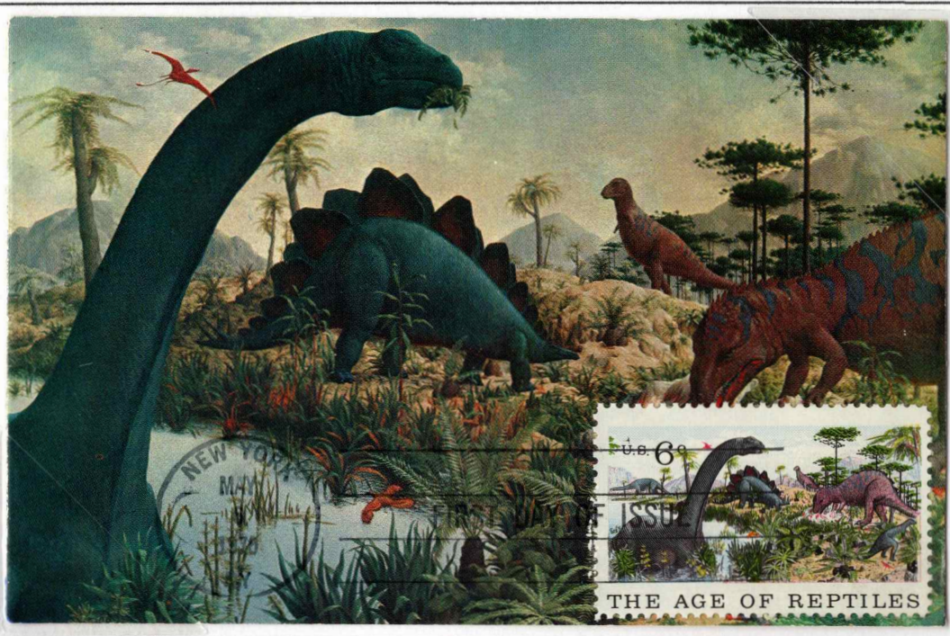
for the Peabody Museum of Natural History.