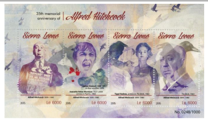
Sierra Leone 2015 minisheet Alfred Hitchcock movie director l-r Scott 3526a Hitchcock holding clapboard; 3526b actors Janet Leigh and James Stewart; 3526c actor Tippi Hedren; 3526d Hitchcock and crows