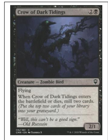
Crow of Dark Tidings Magic: The Gathering playing card Creature: Zombie Bird #105 Common