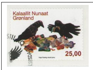
Greenland 2019 Oct 21 Plastics destroying the environment 25k stamp crows and garbage

Crows scavenge corpses as well as garbage. They can be aggressive and threatening, as in Alfred Hitchcock’s 1963 horror-thriller, The Birds . For centuries they have been seen (like their raven relatives) as omens of death. And so they have been depicted in philately.