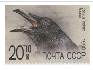
Russia 1990 corvid corax (raven) on 20k + 10 stamp issued to raise funds for zoos

David Dean: david.malcolm.dean@gmail.com