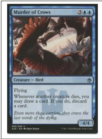
Murder of Crows Magic: The Gathering playing card Creature: Bird #70 Uncommon

Others say it is because crows are associated with death. They scavenge dead animals and gather in the aftermath of battle. In many cultures they are harbingers of death. In Alfred Hitchcock’s 1963 horror-thriller, The Birds , they even kill.