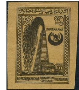
Earliest issue with a gushing derrick.

"No prouder men on earth you'll find, In station high or low, They drive the drill, the Derrick wind, And make the black gold flow..."