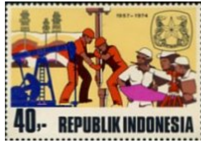
Roughnecks make up kelly to the drill string.