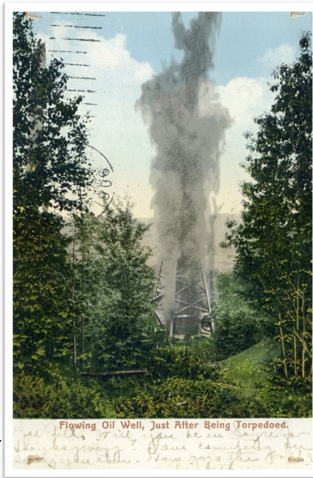
Flowing Oil Well, Just After Being Torpedoed.