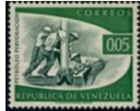
Roughnecks changing drill bit on rig floor.