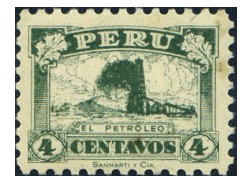
Smallest gushing derrick issue.