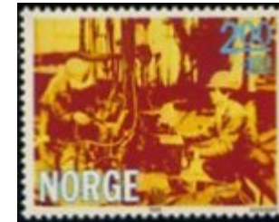
Roughnecks at Rig floor with Drill pipe Elevator.

"No prouder men on earth you'll find, In station high or low, They drive the drill, the Derrick wind, And make the black gold flow..."