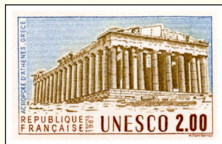
Parthenon Commemorative Issue 1987