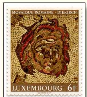
Medusa Mosaic - 1942