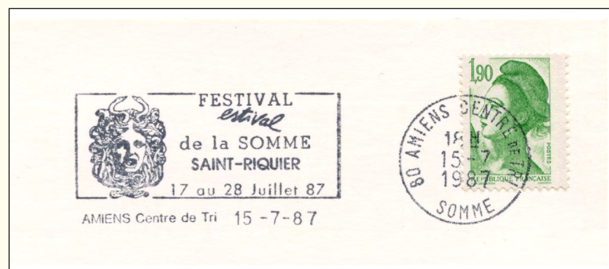
Head of Medusa in advertising slug of machine cancel - 1987

Being unable to punish Poseidon, Athena punished Medusa for being party to the transgression and cursed her. Medusa's once treasured hair changed into horrid poisonous serpents and her gaze turned innocents and soldiers into stone.