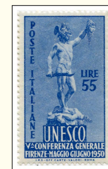
Perseus with Head - 1950

Perseus returned, turned Polydectes to stone, freed his mother and presented the head to Athena.