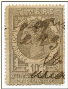
Medusa Revenue circa 1820