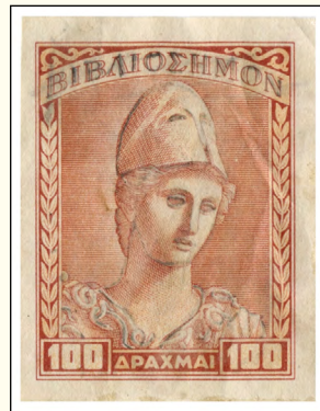
Athena School Book Revenue 1946