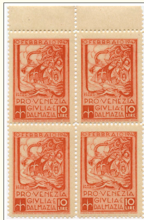
Sailor's Fear of Medusa Revenue Block of 4 - 1942

Danaë, the mother of Greek hero Perseus was desired by king Polydectes. In an effort to protect her from him, Perseus agreed to bring him Medusa's head.