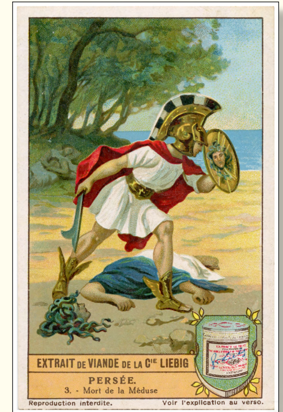
Death of Medusa Liebig Advertising Card - circa 1932

Looking only at Medusa's reclining figure in the mirrored shield's reflection, he cut off her head as she slept and slipped it into the sacred bag.