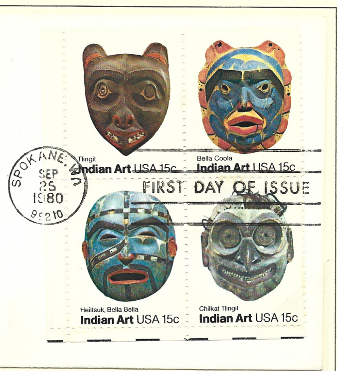
Hand-painted cachet (ex-Mohler) Note how the details that differ from the template