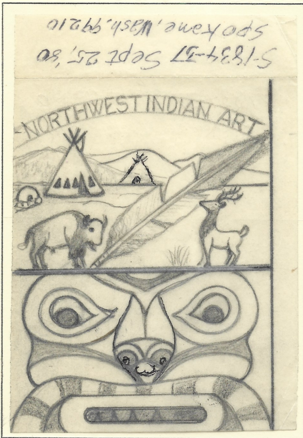
Template - pencil on tracing paper with minor inked changes.