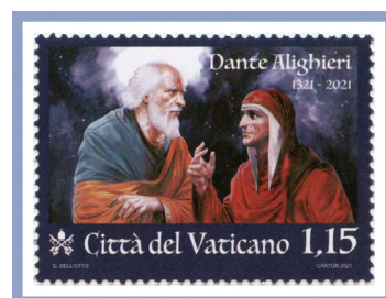
VII Centenary of Death