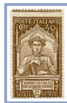
Perforation shifted up