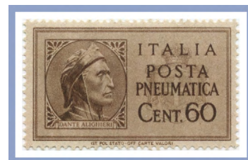
Pneumatic Post, 1945 Issue

Ravenna, Italy to Beacon, New York,, 13 June 1923 Split back card #3775 Edition Lavagna, Ravenna, Italy