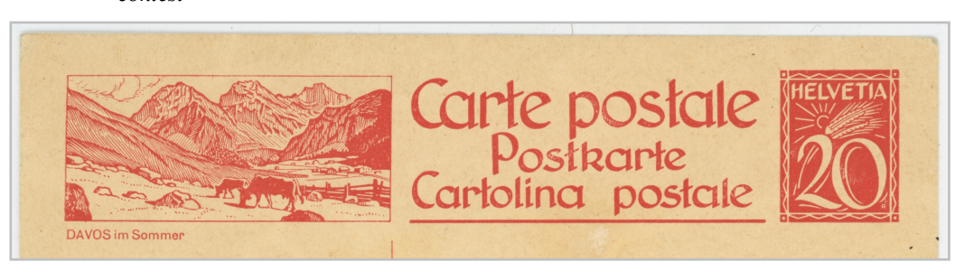
High alpine pastures are the spring destination of the Alpaufzug, here overlooking Davos – International rate illustrated postal card – designed by the post office to promote tourism