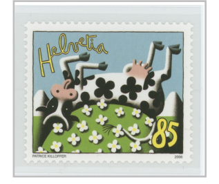
A happy cow celebrates the arrival of fresh spring grass and wildflowers