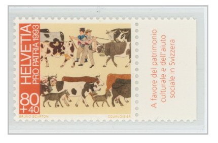
Traditional folk illustration of the Alpaufzug – Italian language marginal tab