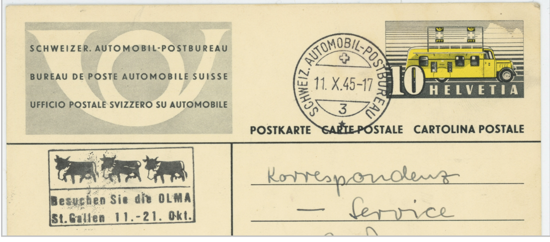
Cows are on display at OLMA, the annual national agricultural and nutrition show – Domestic rate postal card with mobile post office cancel and postal cachet