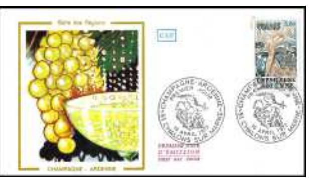
French champagne flowed nightly for the patrons. First-day cover reduced 50%