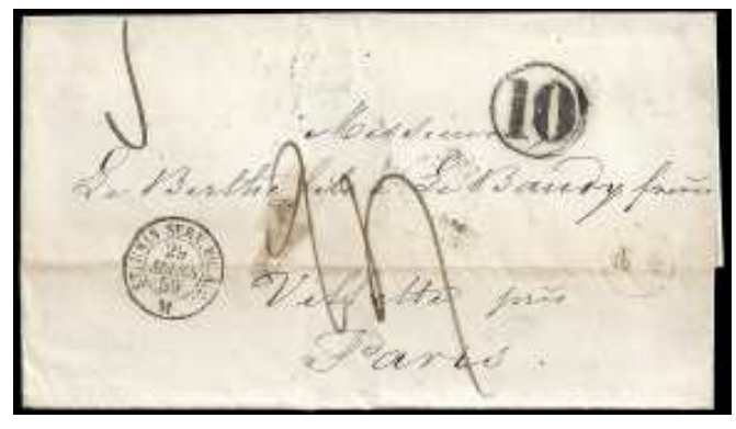
Stampless cover, Paris, March 29, 1859. Mailed from the 10th district. Reduced 50%

Steinlein was born in 1859; he died in 1923.