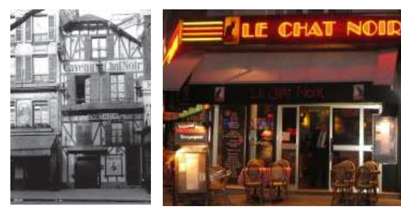
The impresario, Rodolphe Salis, opened the cabaret on November 18, 1881 at 84 Boulevard de Rochechouart. After 1897 it reopened at 68 Boulevard de Clichy (above) where it later became modernized.

Le Chat Noir—The Black Cat—was a famous cabaret in 19th century Paris.