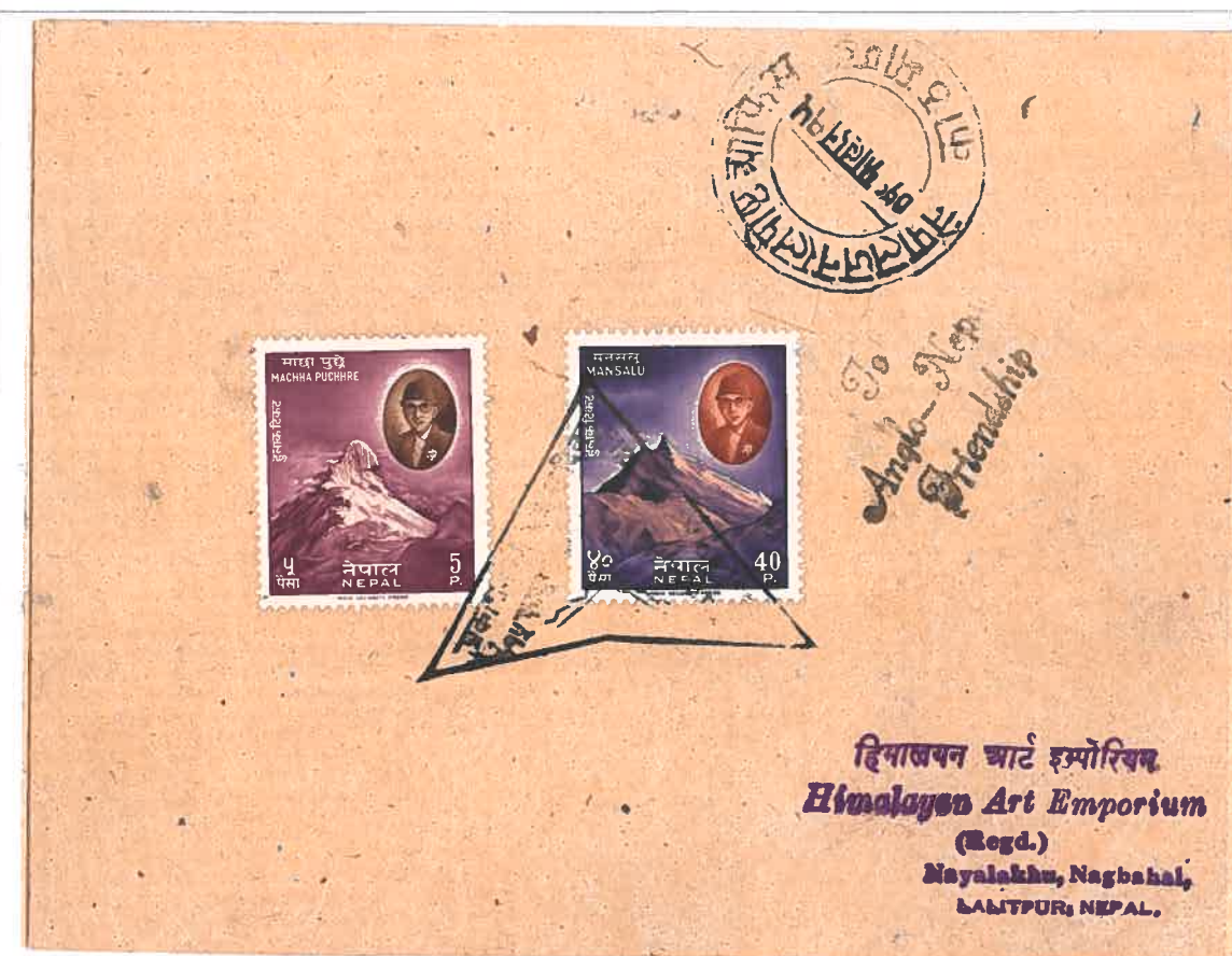
Nepalese First Day Cover, unfolded and split to show both sides.