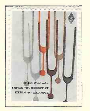
Essen 1962. Vignet Sängerbundesfest

Lichtenstein 2018. The piano technician tunes and maintains the piano with the help of a tuning fork and his well-trained perfect pitch.