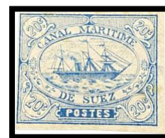
'Spiro' 1880. forged stamp. Type I & III