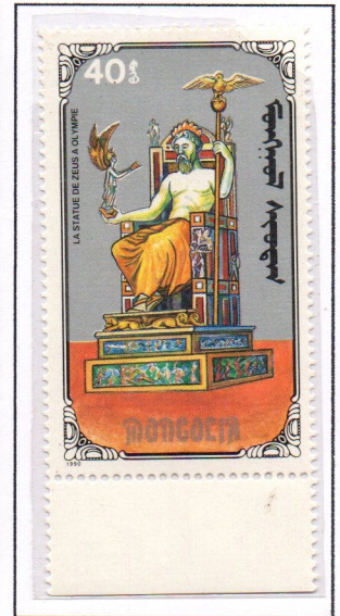
The Statue of Zeus at Olympia (435 BC)

The Lighthouse of Alexandria was built by the Ptolemaic Kingdom of Ancient Egypt, in the reign of Ptolemy II Philadelphus. It was about 100 metres in overall height. The lighthouse was severely damaged by three earthquakes between 956 and 1323 AD.