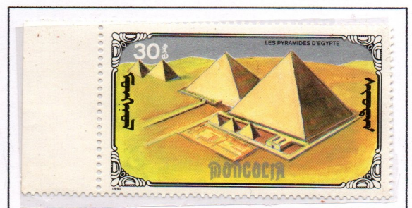
The Great Pyramid of Giza (2584-2561 BC)

The Temple of Artemis was a Greek temple dedicated to an ancient goddess Artemis. It was located in Ephesus. By 401 AD it had been ruined or destroyed.