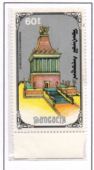
The Mausoleum at Halicarnassus (351 BC)

The Mausoleum at Halicarnassus was a tomb built for Mausolus, a satrap in the Achaemenid Empire. It was destroyed by successive earthquakes between 12th and 15th century AD.