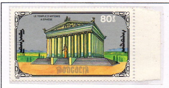
Temple of Artemis (550 BC)

The Temple of Artemis was a Greek temple dedicated to an ancient goddess Artemis. It was located in Ephesus. By 401 AD it had been ruined or destroyed.