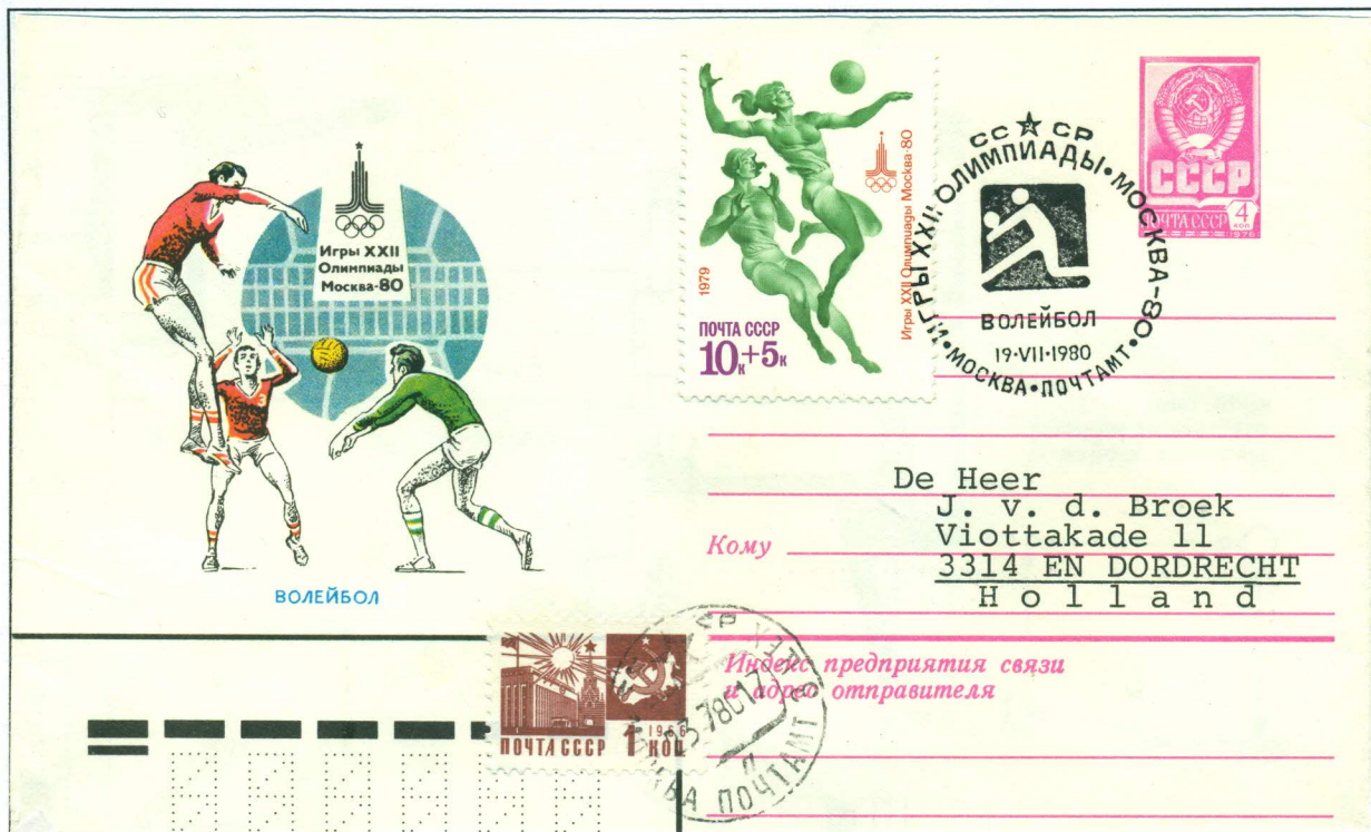
Stationery USSR (1980) – Illustrated cover

A block (one person or more) is performed by jumping and placing one's hands above the net with no penetration into the opponent's court and with the palms up and fingers pointing backwards.