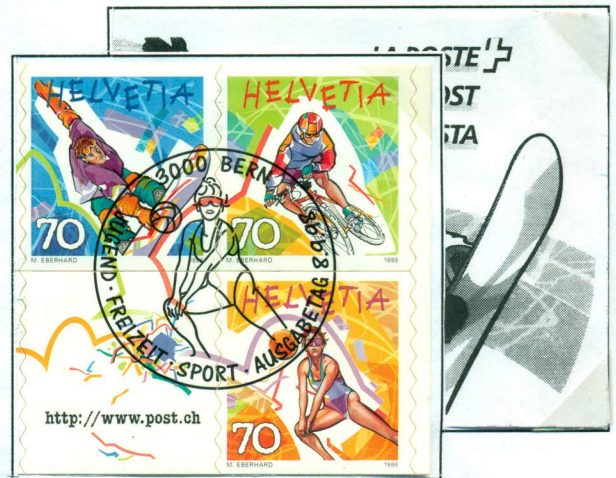
↑ Stamp booklet with adhesive stamps

Volleyball is a team sport, played by two teams of 6 players using hands or arms. The complete set of rules is extensive and players must master these.