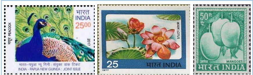
Stamps depicting the Indian Peacock - the National Bird of India, the Lotus - the National Flower of India and the Mango - the National Fruit of India.