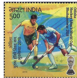
A beautiful stamp depicting the sport of Hockey - the National Game of India.