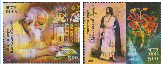
Stamps depicting Rabindranath Tagore, the composer of the Indian National Anthem "Jana Gana Mana". Tagore won the Nobel Prize for literature in 1913.