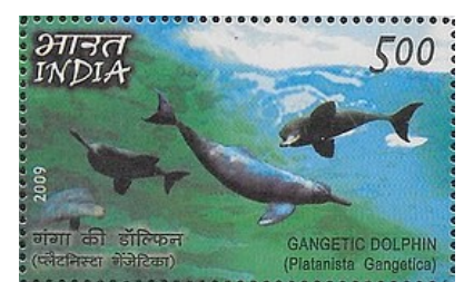
Stamps depicting the holy river Ganga - the National River of India and the Gangetic Dolphin - the National Aquatic Animal of India.