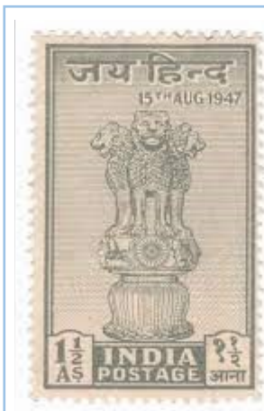
A stamp depicting the State Emblem of India, an adaptation of the Lion Capital of Ashoka at Sarnath. It shows three lions mounted on an abacus with a Dharma Chakra in the centre, a bull on the right and a galloping horse on the left. The motto "Satyameva Jayate" (the truth alone triumphs) is written below in Devanagari Script.