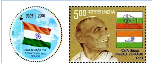
Two beautiful stamps depicting the tricolour National Flag of India and Pingali Venkaiah, the man behind the design of the flag.

With more than a billion people, India is the world's second most populous country and demographically, religiously and culturally very diverse. India has several National Symbols which are an integral part of the country's identity and heritage. These national identity elements instil a sense of pride and patriotism in the heart of every Indian across the globe. The national symbols of India have been depicted beautifully on many stamps released by India Post. The stamps that I would be showcasing in this display are a treasure to my collection.