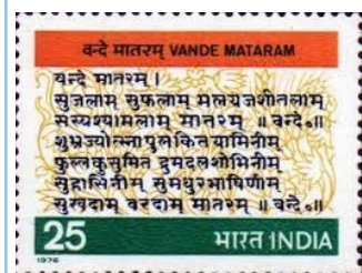
A stamp depicting the National Song of India "Vande Mataram", composed in Sanskrit by the poet Bankimchandra Chatterji.