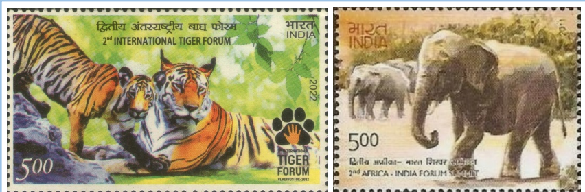
Stamps depicting the Royal Bengal Tiger - the National Animal of India and the Elephant - the National Heritage Animal of India.