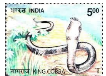
Stamps depicting the Banyan Tree - the National Tree of India and the King Cobra - the National Reptile of India.