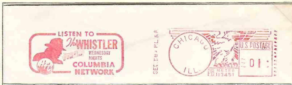
USA 1940, Chicago, Pitney Bowes PB 113451. "Listen to the whistler", Columbia Network: listen to the whistler on Wednesday nights.