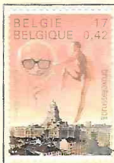
Toots Thielemans, Belgian and American jazz musician, composed the world hit "Bluesette" in 1962 (LP "The whistler and his guitar"). Toots whistles and plays the unison technique synchronously on guitar.