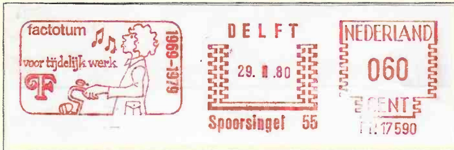
Delft, 29/02/1980, Francotyp "CM 10000" with FR as prefix. Lady whistling, biking and looking for work.

Whistling is a form of art: creating sounds through lip, tongue and breath movement without the addition of an instrument. It is a "body sound" used as a flute language and means of communication on the Canarian island of Gomero (Spain). Declared a World Cultural Heritage Site by UNESCO in the XX th century.