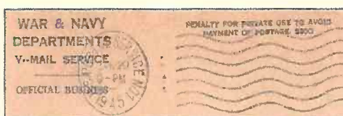
V-MAIL 25/01/1945 to St. Petersburg, Florida. The adventure of "Sinbad, the sailor" drawn in a mini comic strip where the cheerful whistler in complete freedom whistles a lady but ends up in prison.