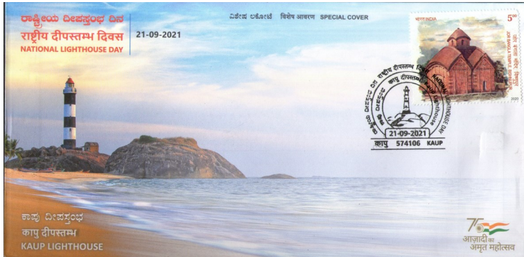
A special cover on Kaup Lighthouse, a century old tower overlooking the Arabian Sea in the Indian state of Karnataka.

History tells us that Vasco da Gama, a Portuguese explorer, became the first European to reach India by sea way back in 1498. Following the Portuguese, the Dutch, the British and the French arrived in India and established their trading outposts. During these colonial times, many lighthouses were built to guide and monitor the movement of travelling ships. As a tribute to these lighthouses, India Post has released many materials of philatelic interest, which are a treasure to my collection.