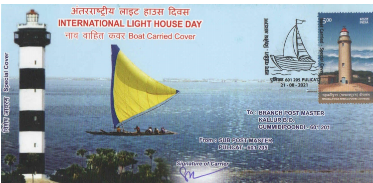
A special boat-carried cover depicting the Pulicat Lighthouse, overlooking the Bay of Bengal in the Indian State of Tamil Nadu.