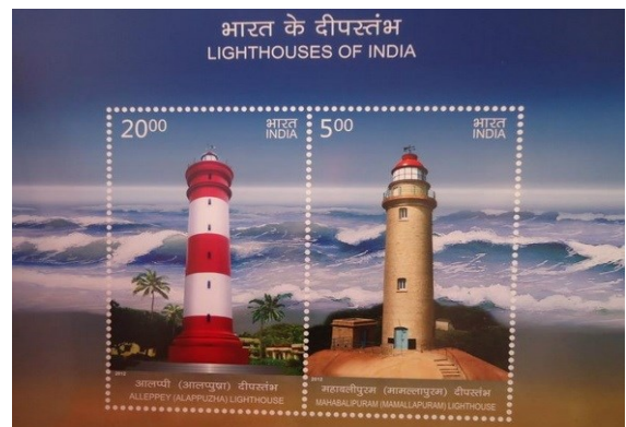
A miniature sheet depicting two lighthouses - Alleppey Lighthouse on the shores of the Arabian Sea in Kerala and Mahabalipuram Lighthouse on the shores of Bay of Bengal in Tamil Nadu.