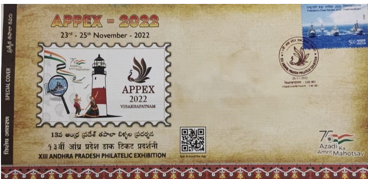
A first of its kind special cover designed with augmented reality technology that depicts the lighthouse of Visakhapatnam, which overlooks the Bay of Bengal in the Indian State of Andhra Pradesh.