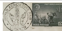
A farmer ploughing field with cattle