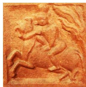
Taming the bull. A statue in Alwarthirunagari, Tamil Nadu, India.

Kangayam breed on stamp by India Post released on 25 Apr. 2000