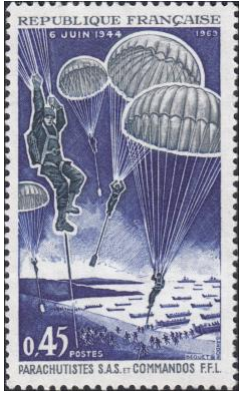
France 1969 commemorative 0.45 F. Perf. 13 (sg:FR 1835)

On 2 April 1982 Argentinian forces invaded the Falklands Islands. The British were vastly outnumbered, 600 Argentine Commandos to 57 Royal Marines, and forced to surrender.