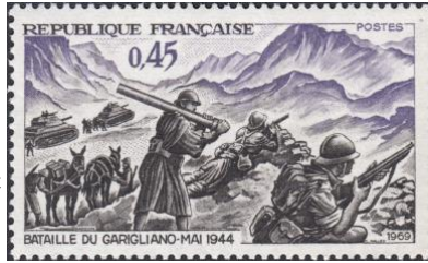
France 1969 commemorative 0.45 F. Perf. 13 (sg:FR 1834)

Five attacks were made on Argentine occupied by RAF Vulcan B Mk 2 bombers. These attacks were code-named 'Black Buck' and each flight from Ascension Island required numerous in-flight refueling sorties by Victor K Mk 2 .