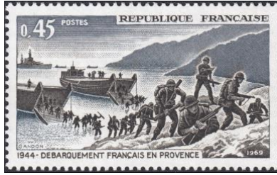
France 1969 commemorative 0.45 F. Perf. 13 (sg:FR 1837)

On 2 May 1982 the British task force reached the Falkland Islands.