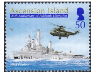
Ascension Island commemorative 50 p. Perf. 13% (sg:AC 968)