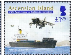
Ascension Island commemorative 1.25 £. Perf. 13% (Mi:AC 1004)