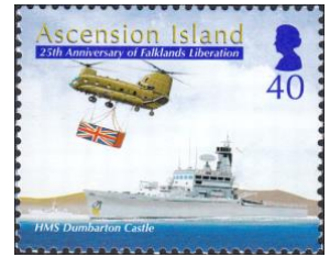
Ascension Island commemorative 40 p. Perf. 13% (sg:AC 967)

On 5 April 1982 the first ships, including HMS Hermes, set sail towards the Falklands. In total, the task force was comprised of 127 ships carrying a reinforced 3 Commando Brigade with 2nd and 3rd Battalions.