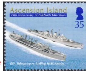
Image Commemorative postage souvenir sheet of the 25th Anniversary of Falklands Liberation 2007 | Reduced 20%

The Avro Vulcan B2 over a map of the South Atlantic indicating the route from Ascension Island and the key re-fueling points for the Vulcan Bomber and Victor Tanker planes.