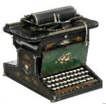
Sholes & Glidden Typewriter 1876 (Remington No. 1)

chartered in Auburn, N.Y. in 1865. The Southern Central began operation from Sayre, PA to Fair Haven, NY in 1871-1872. Travel to the Philadelphia Centennial Exhibition on October 9, 1876, as shown on this S.C. R.R. ticket 3 , was possible on the newly completed railroad.