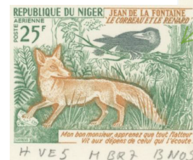
Left: Niger , color proofs for 25f airmail stamp issued 23 November 1972 on the 350th anniversary of La Fontaine's birth. Below, detail. The crow's advice is on the bottom (in French).