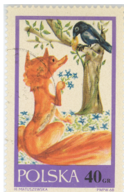
Left, Poland , Fox and Crow on 40gr stamp issued 15 March 1968 one of eight celebrating fairy tales