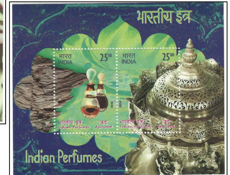
Miniature Sheet of India Post (15-oct-2019) aroma of AGARWOOD