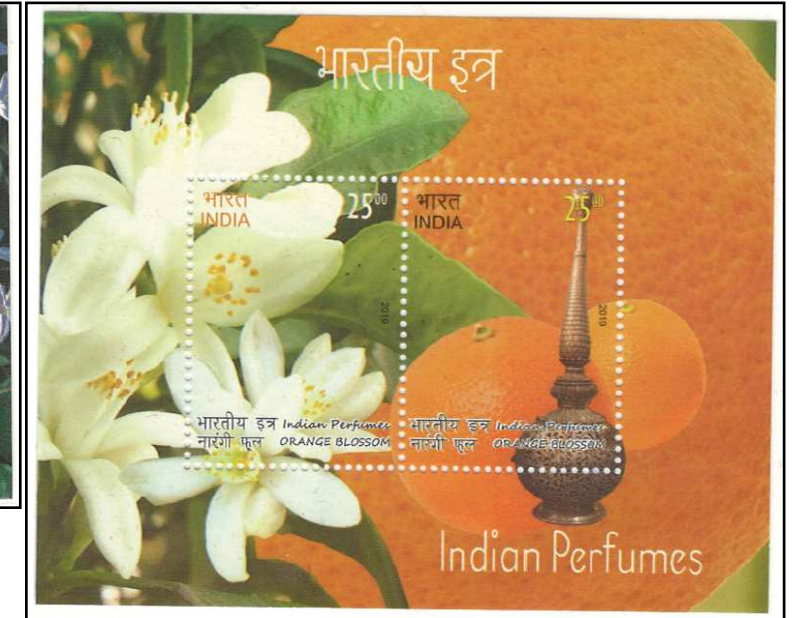
Miniature Sheet of India Post (15-oct-2019) aroma of ORANGE BLOSSOM