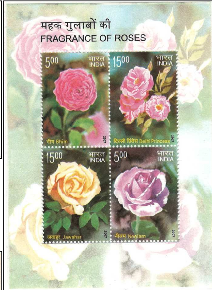
Miniature Sheet of India Post (7-feb-2007) aroma of ROSES