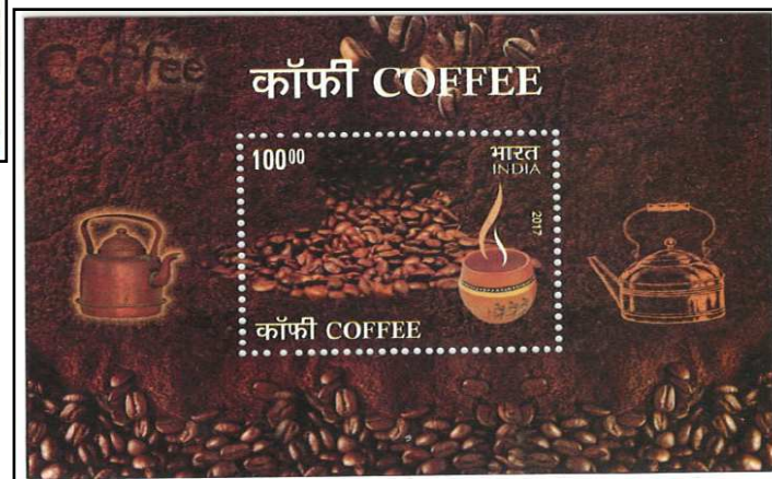
Miniature Sheet of India Post (23-apr-2017) aroma of COFFEE