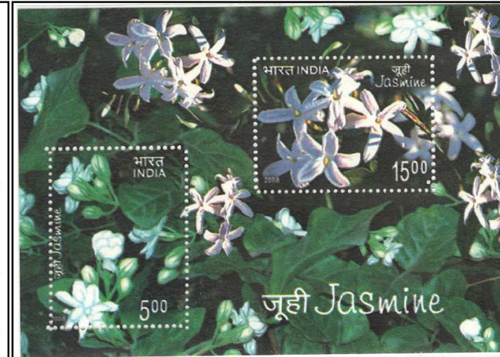
Miniature Sheet of India Post (26-apr-2008) aroma of JASMINE