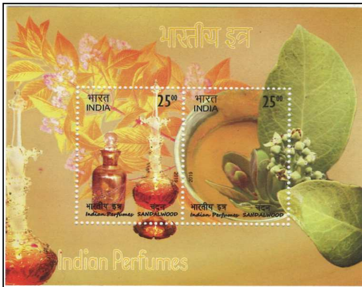
Miniature Sheet of India Post (1-aug-2019) aroma of SANDALWOOD