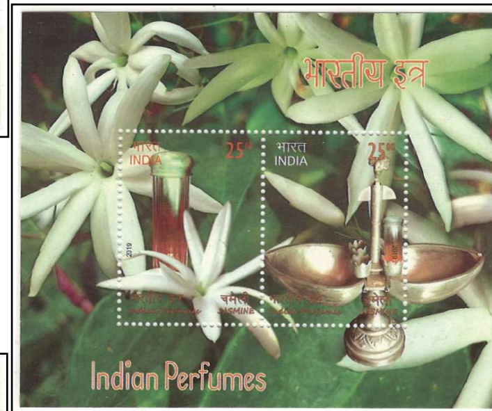
Miniature Sheet of India Post (1-aug-2019) aroma of JASMINE