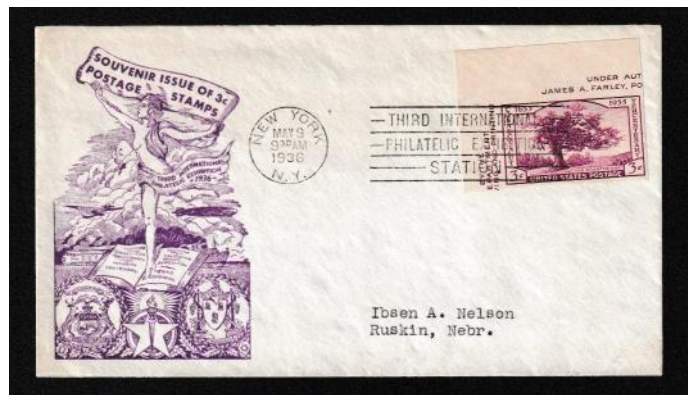
First Day of Issue cover for TIPEX. Stamp is Scott U.S. 778a, cut from the souvenir sheet at left.

In addition to the souvenir sheet mentioned above, there were many poster labels and seals printed for and distributed during this philatelic event. Shown below are a few examples.