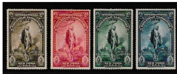
Above printed by American Bank Note Co.

The Third International Philatelic Exhibition ended May 17 after setting a number of philatelic exhibition records up to the time, including attendance, number of exhibit entries, and sales of items by the U.S. Post Office Department. TIPEX was a roaring success on many levels.