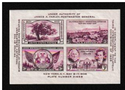
Scott U.S. 778

For TIPEX, the Postmaster General authorized a special souvenir sheet (Scott Catalogue U.S. 778) printed by the Treasury Department, Bureau of Engraving and Printing. The souvenir sheet included four different commemorative postage stamps. Over one million of these souvenir sheets were sold during TIPEX by the United States Post Office. During 1936, other than the Army and Navy issues, there were 5 commemorative stamps and the special TIPEX souvenir sheet issued by the United States.