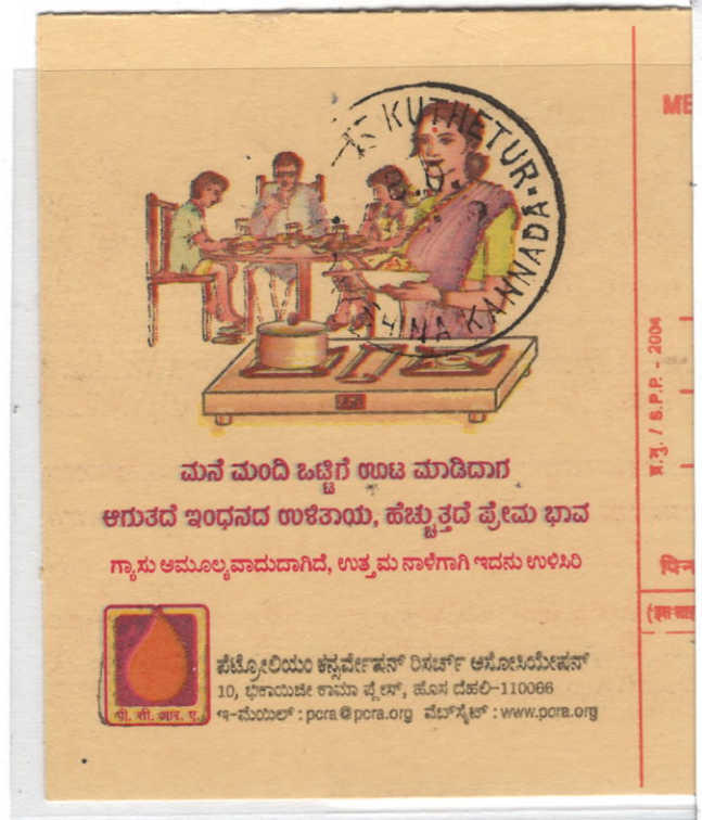
2004 PCRA Megadoot Postcard with 9-9-9 cancellation (Dine together to Save Energy)