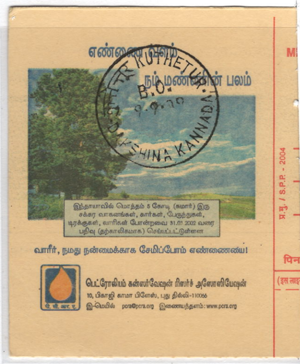
2004 PCRA Megadoot Postcard with 9-9-9 cancellation (Oil Resources)