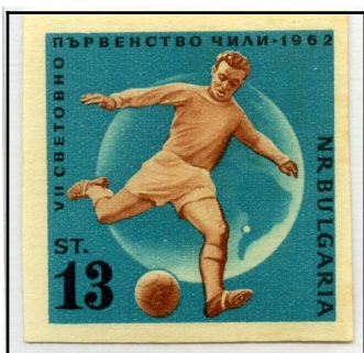
Bulgaria 1962 - imperforate

He could kick with both feet , which is why he scored a large number of goals .