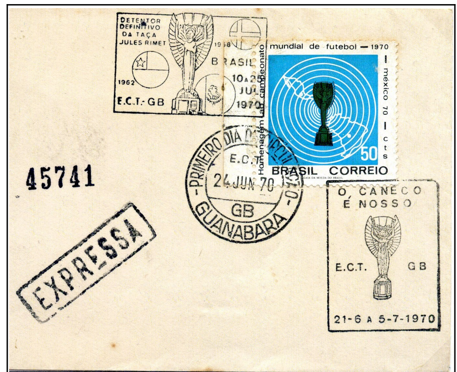
Cancellation of the definitive winning of the Rimet Cup.

In Stockholm in 1958 , he won his first world championship title at the age of 17, but his masterpiece came in 1970, when the Brazil team won the Rimet Cup for ever .