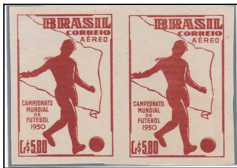
Definitive stamp and colour proofs