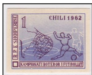
Albania 1962 - imperforate

He wanted to end his glorious career in the shadow of the Statue of Liberty , at the New York Cosmos, to bring soccer to the States. He passed away on December 29, 2022, and this page is his memorial.