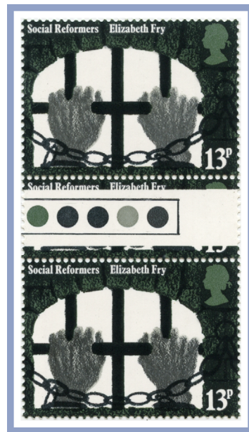
Elizabeth Fry (1780-1845) Social activist

An early member of the society was the English Quaker and social reformer Elizabeth Fry, who was active in prison reform and often called the 'Angel of Prisons' .