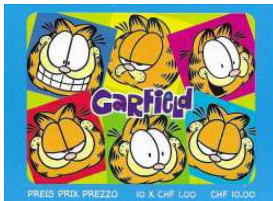
Booklet Cover, Switzerland 2014