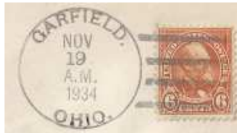
6¢ President Garfield Intaglio Coil Stamp with a 1934 Circular Date Stamp, Garfield, Ohio