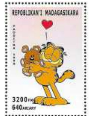
From a 1999 sheetlet