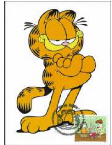
Maximum Card with pictorial postmark; reduced 50%

Cartoonist, Jim Davis, named his feline character Garfield, after his grandfather who was named for the president.