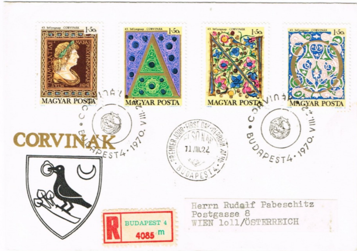
Illuminated letters based on books in the Library. Shown at 90%

He acceded to the throne in 1448. He is illustrated here in portraits and busts.