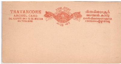
A mint 8 cash Anchal card of Travancore state of 1889

Travancore State, the southern part of the present Kerala state, occupies the southwest part of the Indian Peninsula. Bounded on the north by Cochin and British India, on the east by western Ghats and British India, on the south by Indian Ocean and on the west by Arabian Sea. The state had a progressive administration, it had its own postal system known as the "Anchal". Travancore had treaty with neighbouring princely state of Cochin whereby interstate mails could be exchanged and delivered. For posts, outside Travancore and Cochin, imperial post offices were used.