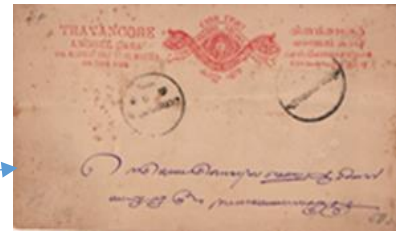
A postally used 8 cash card with a Malayalam cancellation of 1890 from Thiruvanthapuram to Nedumangadu.