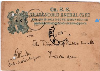
A very rare Sircar Service (on S.S.) Travancore Anchal card with a 6 cash Overprint on a five cash Post card.

There used to be Boat (Canoe) Mail service in Travancore. Trivandrum-Quilon-Alleppy-Vaikom-Parur. There used to be daily boat service (ferry) from Trivandrum to Vaikom. A private post card with 4 cash stamp with a "Thi 1" cancellation of the Trivandrum Anchal Office (1908). This is a good example of Boat (Canoe) cancellation with the so many cancellations of like Attingal, Quilon, Kayamkulam, Alleppy, Vycome, Edapally (All Travancore State Anchal Offices) and Cochin (Cochin State) all in Malayalam and single lined round cancellations and addressed to Volkart Brothers, Cochin (Cochin State).