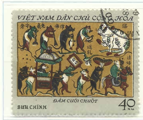
Folk Engraving from Dong Ho – Wedding of Mice. Vietnam, 1972. Dong Ho paintings, a traditional folk art from northern Vietnam, combine natural materials and warm colors.

Then Father Mouse goes home and invites Ken, the mouse next door, to marry his beautiful daughter Kiko. And they live happily ever after.