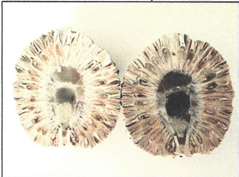
Fossil Araucaria mirabilis cones, Argentina. Above: Whole cone, about 2 inches tall. Right: Cone, about 3 inches tall, cut in half and polished to show seeds. (Photographs of specimens in my collection.)

The stamps depict a second species, Araucaria araucana , that lives in isolated forests in Chile. This giant species, the national tree of Chile, can reach a height of 160 feet and live up to 2000 years.