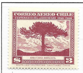
Airmail stamp with Araucaria araucana .

The stamps depict a second species, Araucaria araucana , that lives in isolated forests in Chile. This giant species, the national tree of Chile, can reach a height of 160 feet and live up to 2000 years.