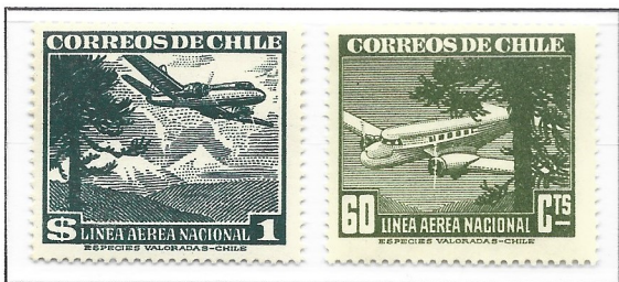
Above: Airmail stamps, plane and A. araucana . Right: 75-centavos A. araucana stamp issued 1976 for Chile's Reforestation Campaign. Far right: Airmail cover, Santiago, Chile to Morris Plains, New Jersey. Pair of 10-centavos A. araucana stamps.