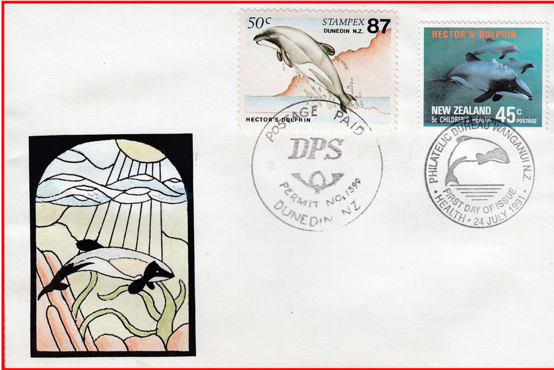
First Stamp 1991

Hector's dolphin is the world's smallest marine dolphin, 1.3 m, only found in shallow waters around New Zealand. Continued deaths in fishermen's nets and lack of political will for their protection threaten these coastal dolphins. Philatelically appear on 10 NZ stamps (1991-2012) – they tell the story