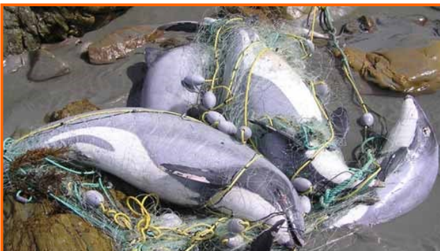
Setnets entangle & kill Hector's Dolphins