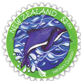
Circular S/A 2007