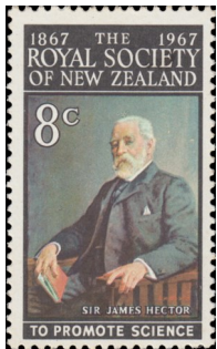
Sir James Hector 1967 discoverer 1873