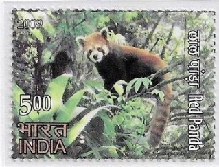
Postal stamp issued by India in 2009

It lives in high altitude, temperate forests with bamboo understories in the Himalayas and other mountains.