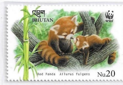
Postal stamp issued by Bhutan in 2009

Red Panda's feed mainly on leaves of bamboo. The occasionally eat fruits, insects, bird eggs and small eggs too.