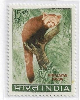
Postal stamp issued by India in 1963

A small body mass allows it to walk on branches. Red Panda's are excellent climbers as they have as they have strong, curved claws.