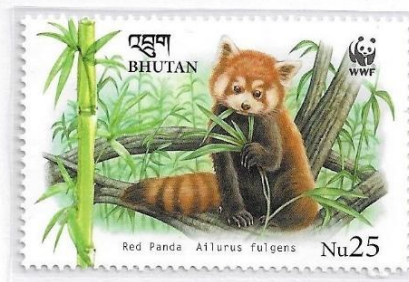
Postal stamp issued by Bhutan in 2009

Red Panda's feed mainly on leaves of bamboo. The occasionally eat fruits, insects, bird eggs and small eggs too.