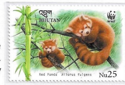
Postal stamp issued by Bhutan in 2009