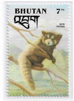
Postal stamp issued by Bhutan in 1993