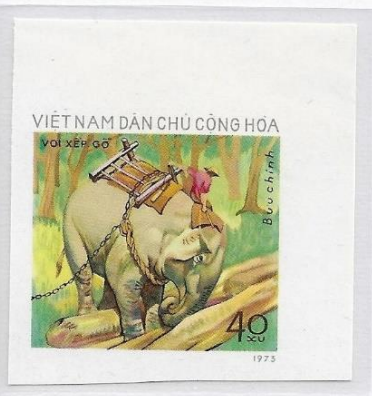
North Viet Nam 1974, Imperforate

1842, Postally used one penny Mulready envelope stereo A 174 with Maltese cross cancel.