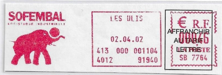
France 2002, Meter cancel with advertisement. Neopost/Satas (digital) 2000.