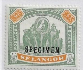
Selangor 1895, Specimen

We have continued to derive cheap thrills by employing them at circuses, zoos and sports.