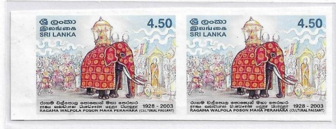
Sri Lanka 2003, Imperforate Pair.