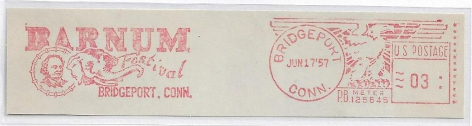
U.S.A. 1957, Meter cancel with advertisement, Pitney Bowes, Models RF, RT series (multi value), March 1942.

This unending exploitation has threatened the survival of elephants on the planet. Its time for us all to come together with renewed vigor to stop it!