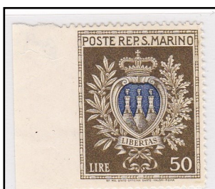
Coat of arms (Imperforate on the left)