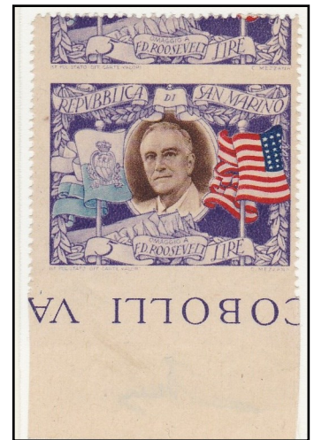
Imperforate at the bottom with perforation strongly displaced at the top.

Three months before his death, on 17 January 1945, he sent the following message to the leaders of the Republic: "Today more than ever the friends of Liberty find encouragement in the truth demonstrated by San Marino with its own experience and expressed in the words of President Lincoln with his message of 7 May 1861" (reproduced on the stamp on the right).