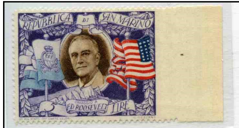
Imperforate at right