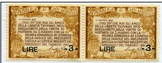
Text in the message in pairs with overprint strongly shifted to the left.

Three months before his death, on 17 January 1945, he sent the following message to the leaders of the Republic: "Today more than ever the friends of Liberty find encouragement in the truth demonstrated by San Marino with its own experience and expressed in the words of President Lincoln with his message of 7 May 1861" (reproduced on the stamp on the right).