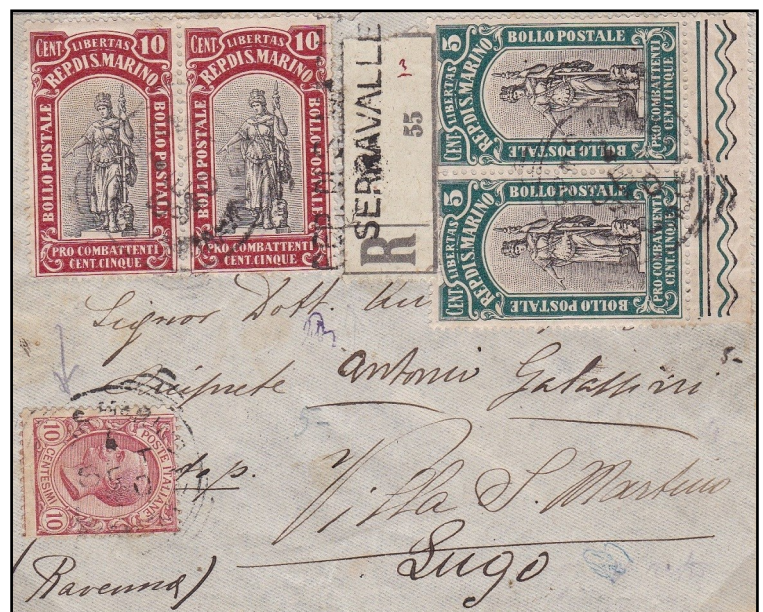
Registered letter from Serravalle to Lugo of 1 September 1920 with 0.25 cents on the reverse side for intrnal tariff and 0.30 cents for the registration fee, taxed at 10 c. (Italian) for poste-restante (shown at 85%)